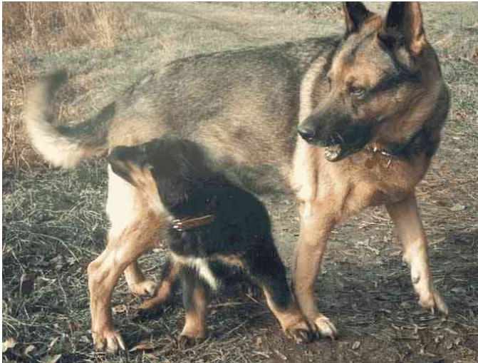
Play with old and young dogs