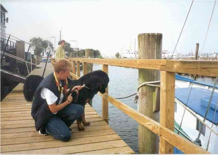
Everywhere with it!

consequence its owner well into its family.