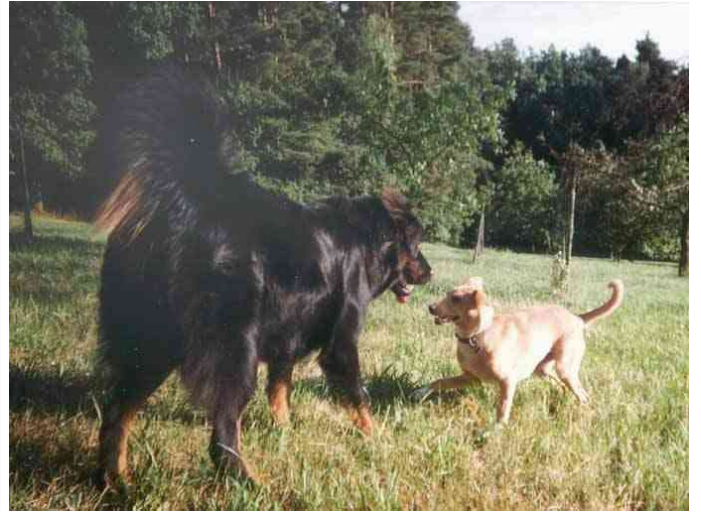
Meeting on the way - no problem!

Large joy prepares Mobility (a type of obstacle run for it, similarly as Agility, but not on measured time). A training for its mobility and its self-confident its is it naturally given defeating of obstacles of all kinds, as a mountain dog always concerns it such functions with circumspection and consideration.