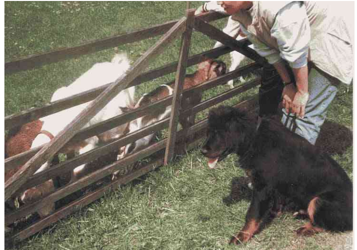
Handling utilizable cattle

The puppies- and young dog phase with the Do Khyi is generally different compared with other dog races and lasts rather for a long time, up to four years must the owner take into account around its dog introduce and train. Peculiar however for herd protection dogs usually: the Tibet Mastiff learns this by watching and copying, requires an exactly considered "associate contact" also with other dogs.